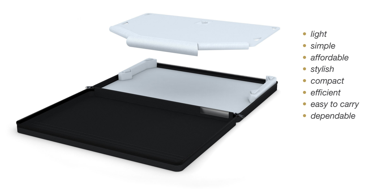
SuitPack Tailored is set to become the new standard in suit packing for the menswear industry.